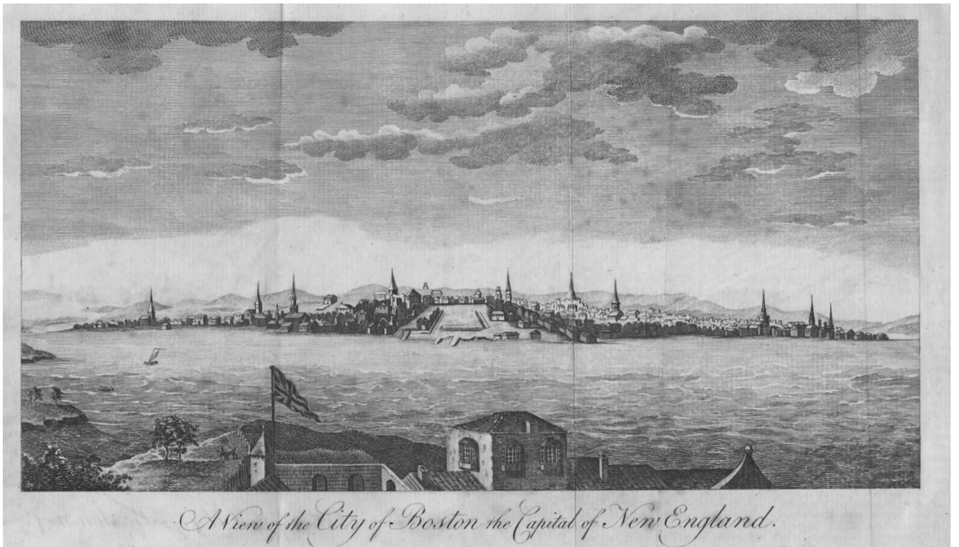
A View of the City of Boston the Capital of New England.